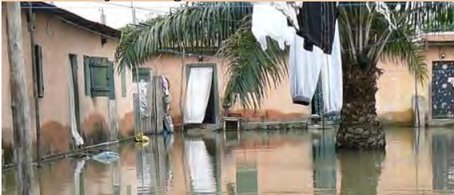
The city of Lome, Togo, affected by severe flooding.